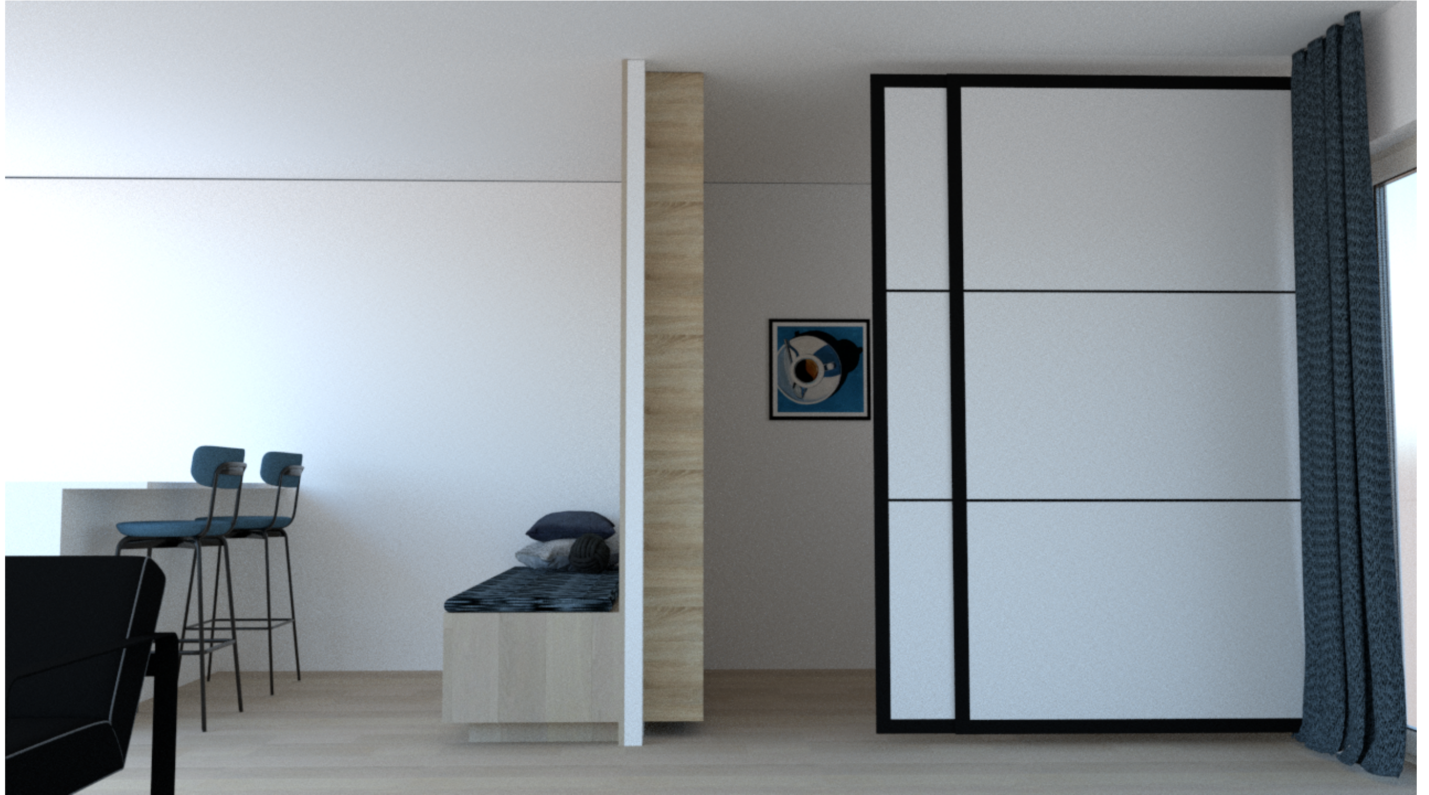
| OFFICE SIDE VIEW/ELEVATION