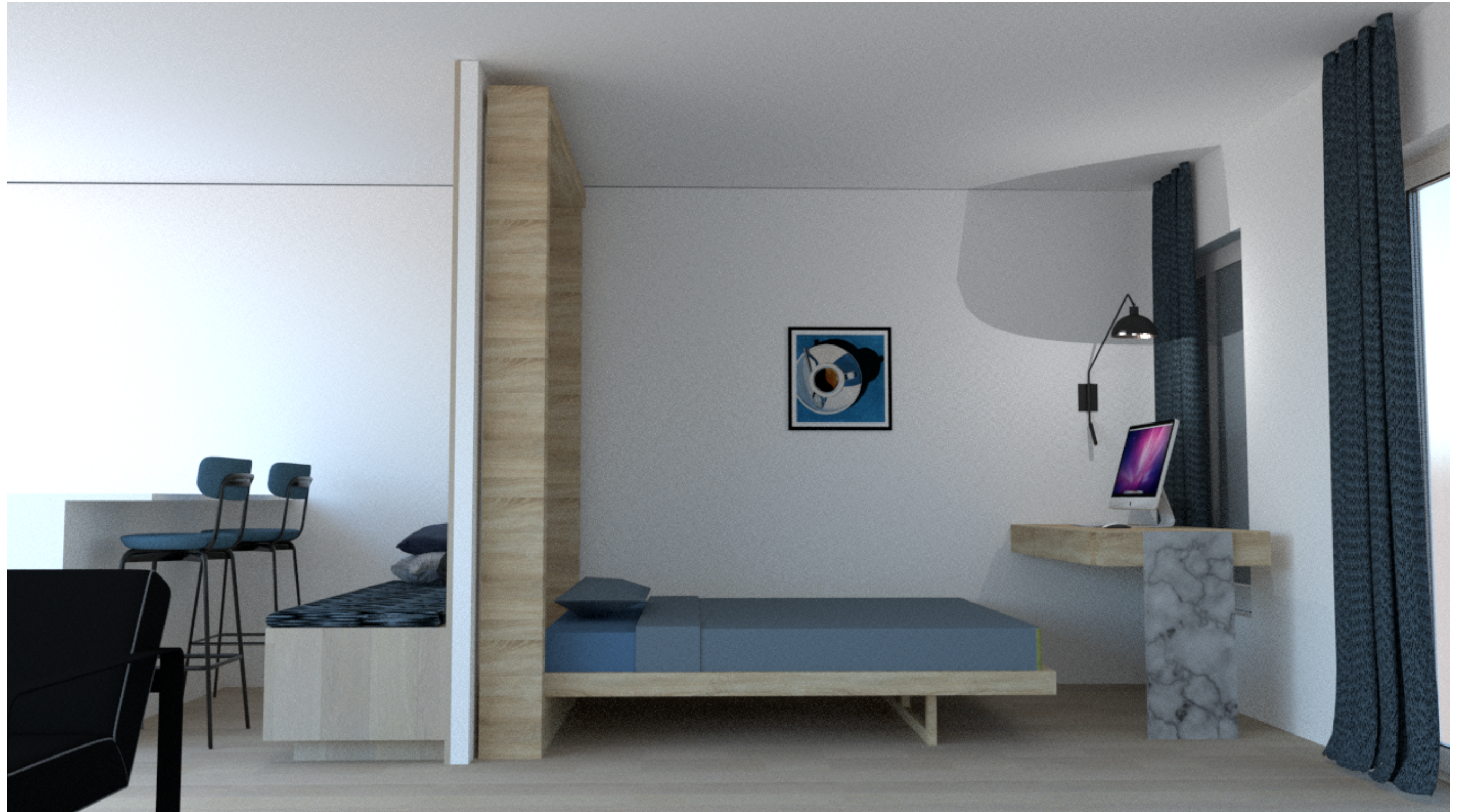
| OFFICE SIDE VIEW/SECTION WITH OPEN MURPHY BED