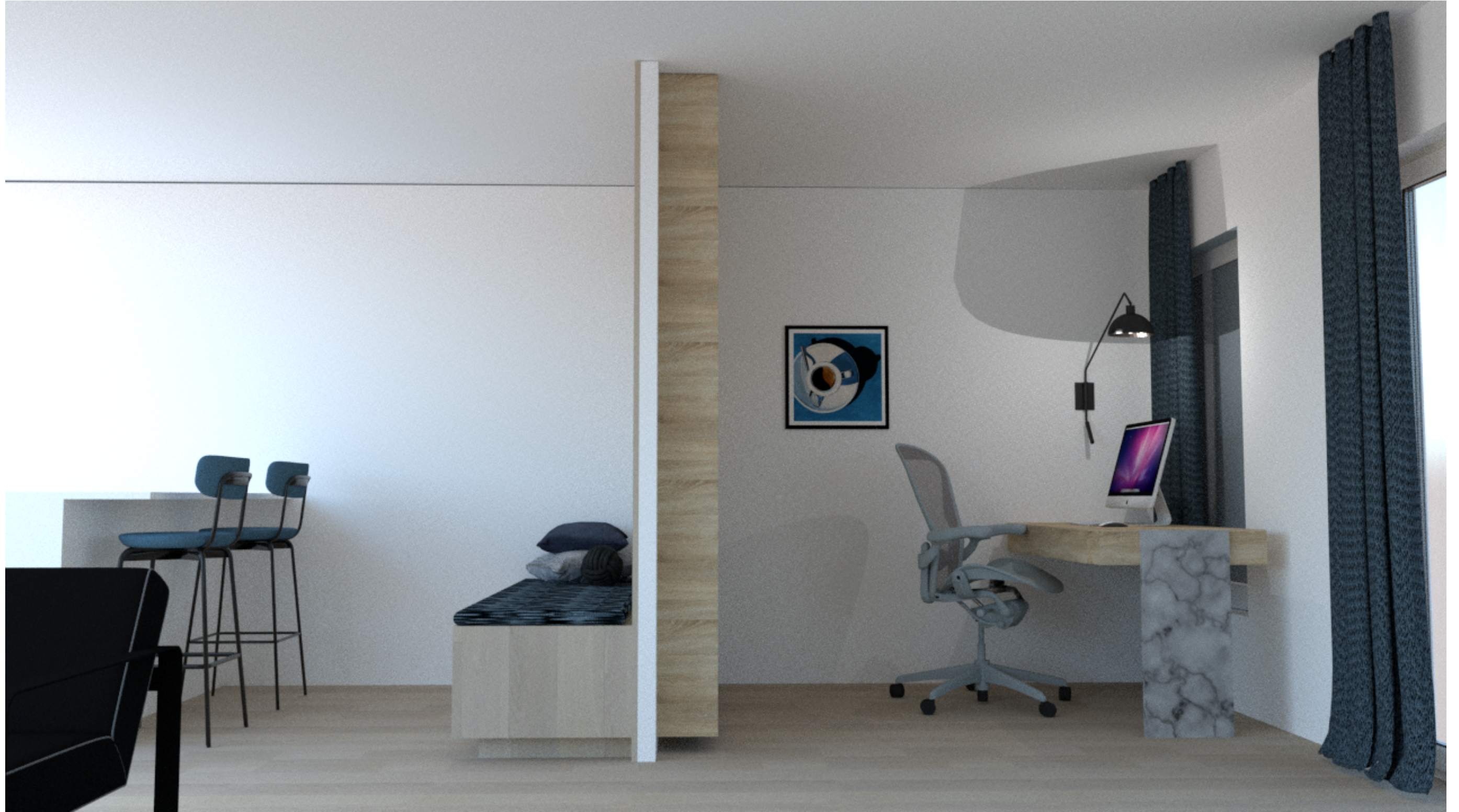
| OFFICE SIDE VIEW/SECTION INSIDE